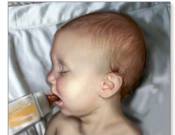
Children should never be put to bed with a bottle